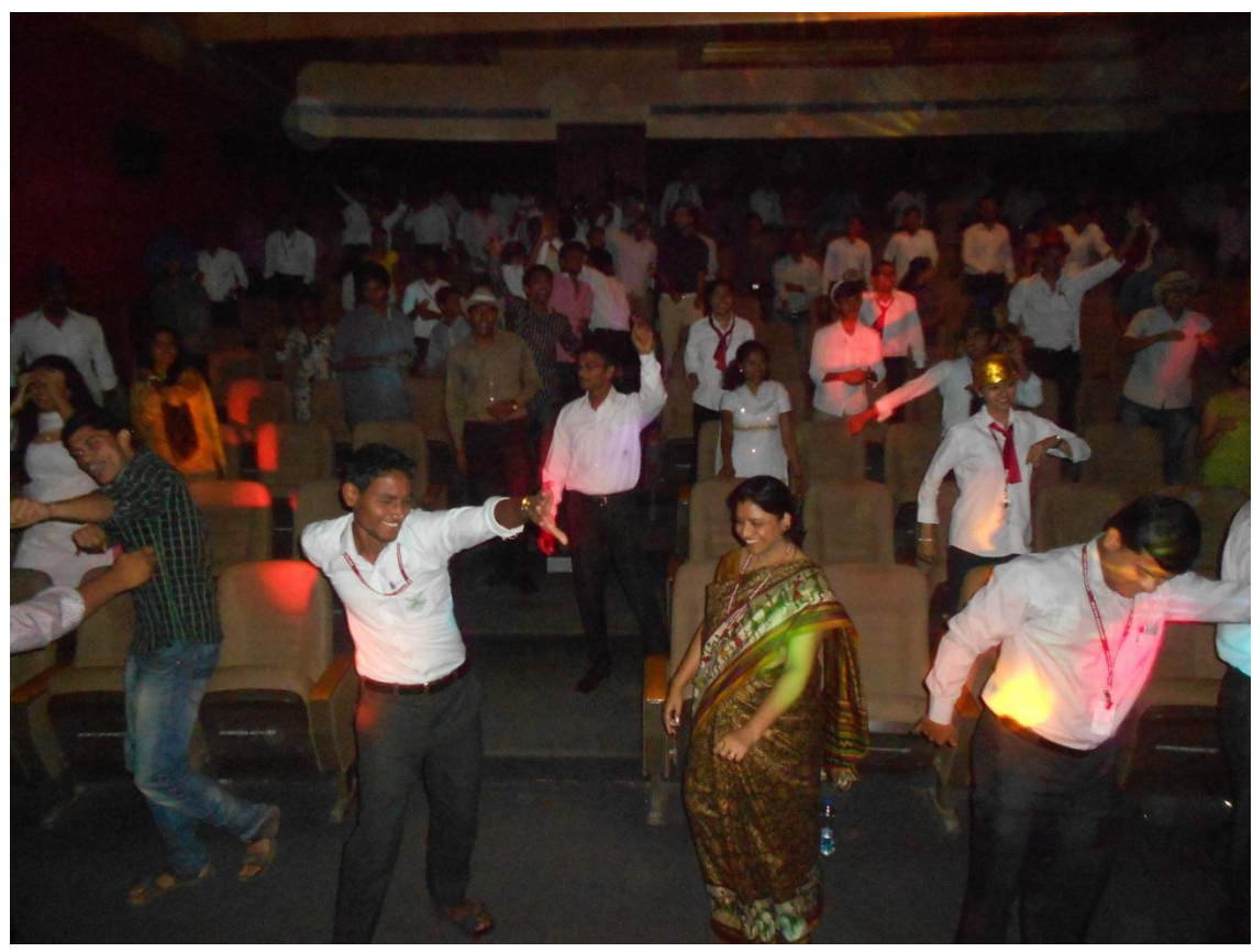
The entire student while performing task