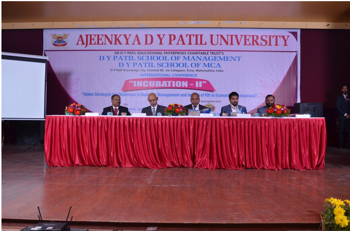
International conference-INCUBATION II